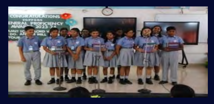
General Proficiency - Standard III