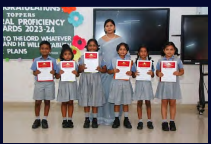
General Proficiency - Standard II