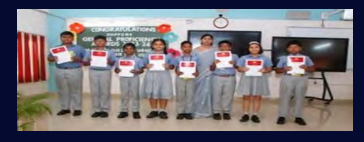
General Proficiency - Standard VIII