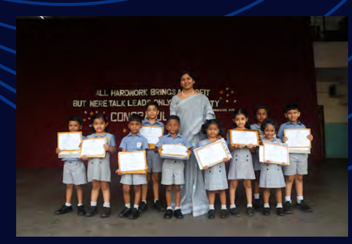
General Proficiency - Class 1