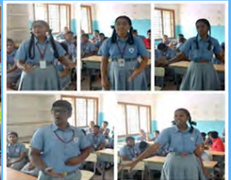
DRAMA ENACTMENT WITNESSES THE POWER OF RAW EMOTIONS

Timpany Steel City School students showcased their innate talent by enacting Shakespeare's play "Macbeth" on 21 March 2024.